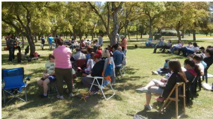
Day of Fellowship at El Alamillo Park, Sevilla