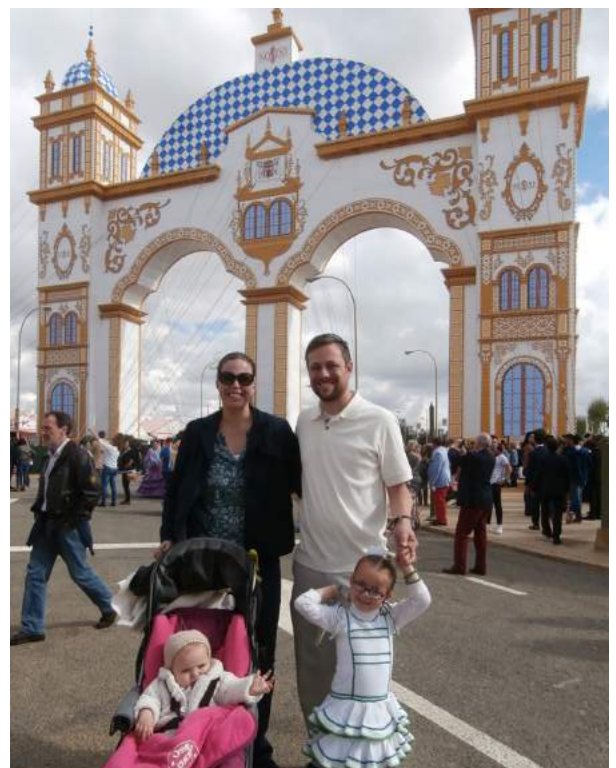
At the entrance to the Sevilla Fair "Feria de Abril"