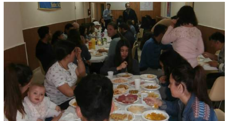
Easter Sunday Feast!

Some of you already know we had a very special Easter week here. We had over 40 people attend our Good Friday Service and over 65 at our Resurrection Sunday service, that included a drama and luncheon afterwards.