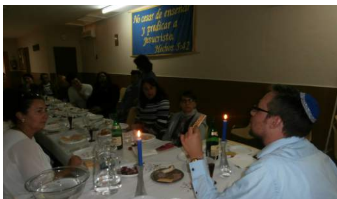
Puebla del Río's Passover

As we look back on this year of service we can say it has been one of the most productive, challenging, emotionally straining, and the most fruitful year of service in the 11