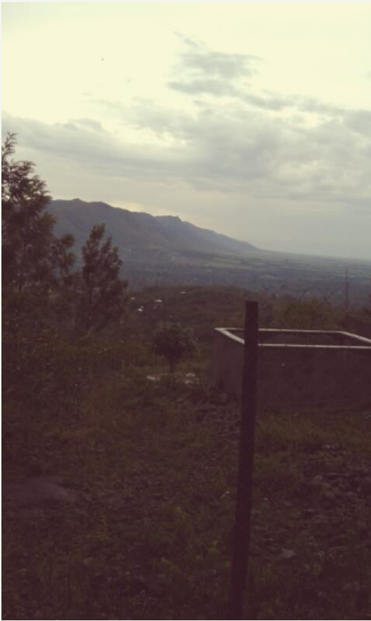
Beautiful Africa (this picture does not do it justice)