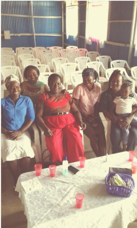
Women from my class on Saturdays

I'm now becoming, and trust that God is good and what He has for me is the best thing.