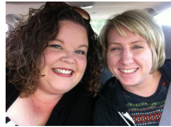
Sr. Year 2015-2016

As I set out on this next part of my journey, stepping out in faith onto the bridge that the Lord has placed in front of me, there are many things that will be happening....