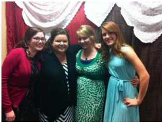
Fr Year 2013-2014

I have crossed both kinds of bridges sense I have been serving the Lord these past 7 years. And I have to say, I prefer the strong ones over the old ones any day, as I'm sure most of us do. With this new bridge in front of me I'm reminded of some of the bridges I have crossed before. At the time, I felt like I was crossing a raging river on a bridge that was going to fall at any minute only to look back and see that the Lord was calming the waters the whole time and I had nothing to fear because the Lord was with me.