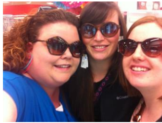
Jr Year 2014-2015