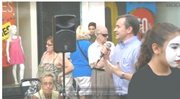
Preaching in the streets back in July

ministering in the interior cities of Pamplona and Logroño. It is true that in the cosmopolitan city of Barcelona and its metropolitan area, evangelical testimony has increased, particularly due to immigration. In other areas, however, like the one where we now serve, there are many towns with very scarce testimony. Our prayer is that many will believe, as it was in the case of the Gadarene.