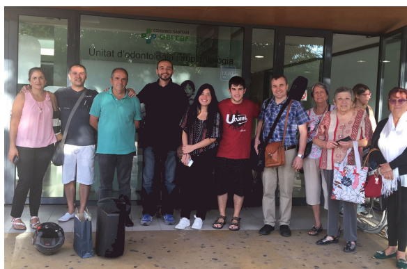
Group witnessing in the county hospital

As you know, we are church planting with a friendly connection with a local church in Vilanova I la Geltrú. Since they planned a series of evangelistic sermons and group Bible studies on John (beginning on October 2 nd ), we jumped into it, using it for our church planting. Therefore, in addition to helping this local church with their church plant in Cubelles, we are praying, planning, and working towards two more groups: one in Catalan language, and the other one in Sitges. Sad to say, most evangelical testimony in Catalonia, due to the influence of immigration, uses the Spanish language. Consequently, there is hardly any direct effort or ministry to the Catalonian people in their own language. We understand that the Catalonian person, as the Spaniard, is usually more traditional Catholic and less receptive to the gospel; however, we prayerfully desire and work for an opening door in that area. Please, help us with your prayers. The other small groups in Cubelles and in Sitges.