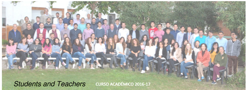
Students and Teachers CURSO ACADÉMICO 2016-17

This has not changed much from what we expected, perhaps, only increased a bit. We are now teaching Introduction to New Testament and next semester History of Christianity in Spain (this last one presently in preparation). The Lord has added the responsibility of "Practicum," the coordination ministerial practice of the