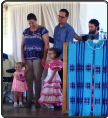
Our family being prayed over in San Quintin, Mexico.