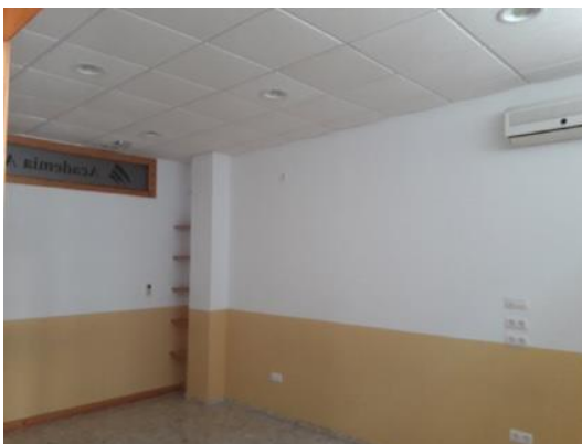
Immediate Building Needs