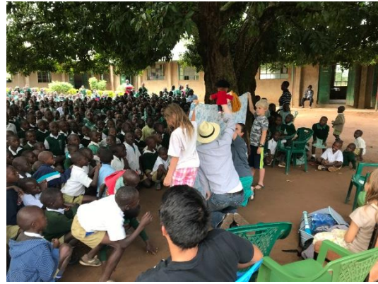
What a blessing to have the freedom to come into these schools and the platform to share with SO many at the same time!