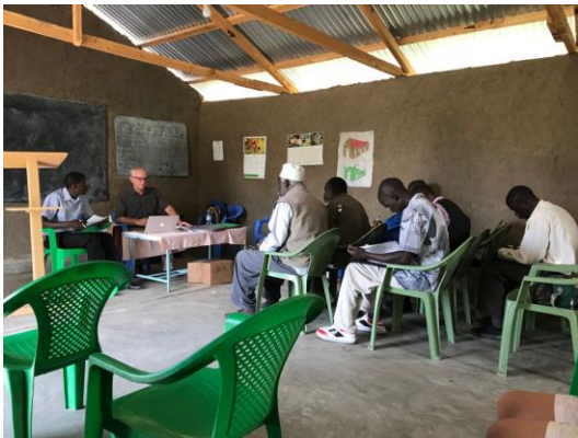
Men's teaching times