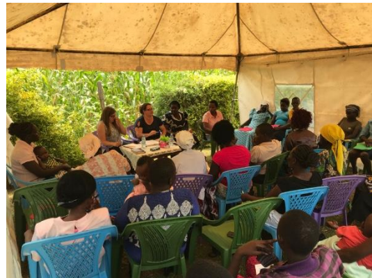
Women's teaching times