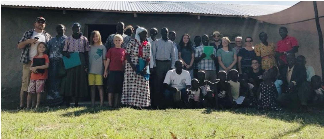
Frontier School of the Bible team-2018

We proclaim, admonishing every man and teaching every man in all wisdom, that we may present every man perfect in Christ.