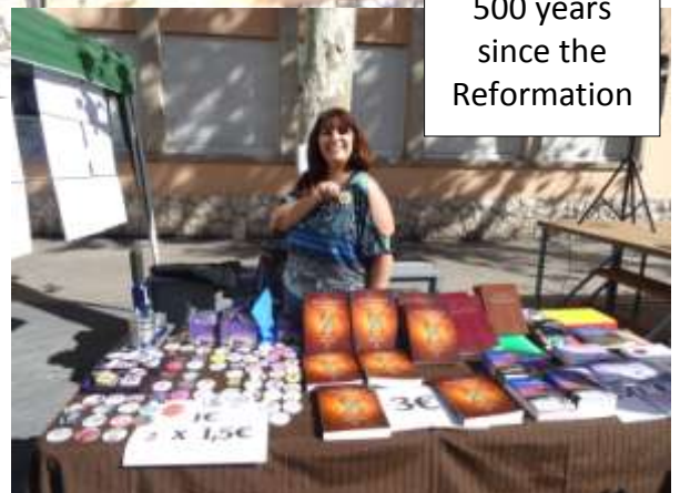
Oct. 21st Evangelistic Outreach Celebrating 500 years since the Reformation