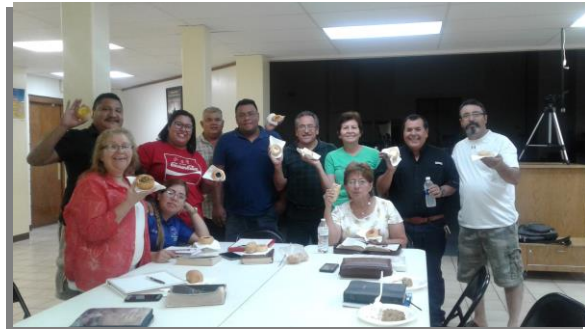
Facilitators enjoy some fresh pastries before starting with their Monday night lesson prep.

Maranatha: We continue to share the gospel of Jesus Christ at church and through our Life Groups. Needless to say that progress has been slow, but the facilitators are not backing down from the task. We meet for prayer, feedback and lesson exposition every Monday night and facilitators teach Tuesday through Friday. We are greatly encouraged by the progress of the each of the facilitators and by the load that they help me carry, like visiting, encouraging, counseling, etc. and I’m called in when the matters are beyond them. We are following the Jethro principle of Exodus 18. Other than the lesson preparation and teaching on Monday nights, I supervise all except my wife’s Life Group, which consists of all women.