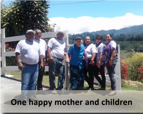
One happy mother and children