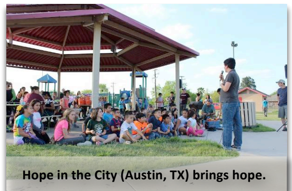
Hope in the City (Austin, TX) brings hope.

As a matter of fact, our Life Group ministry (small groups) took a few weeks off (June) to refresh and refuel. We ended May with some very good statistics. In our traditional ministry mode from 2015 we averaged about 55 in attendance on Sunday and Wednesday nights. Our May 2017 monthly average was 100. Of course, these are simply numbers but these numbers are actually people who are favorably responding to the gospel in our new ministry mode. We also reviewed our primary objectives at the end of May. We started with two main pillars in 2016: 1. To edify the believers and 2. To evangelize the