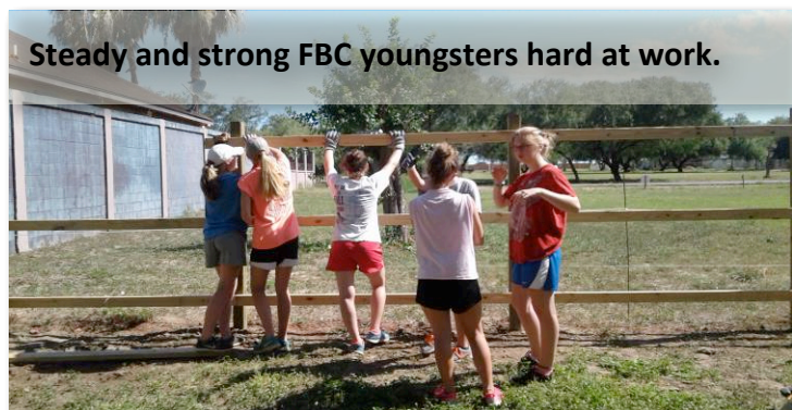
Steady and strong FBC youngsters hard at work.