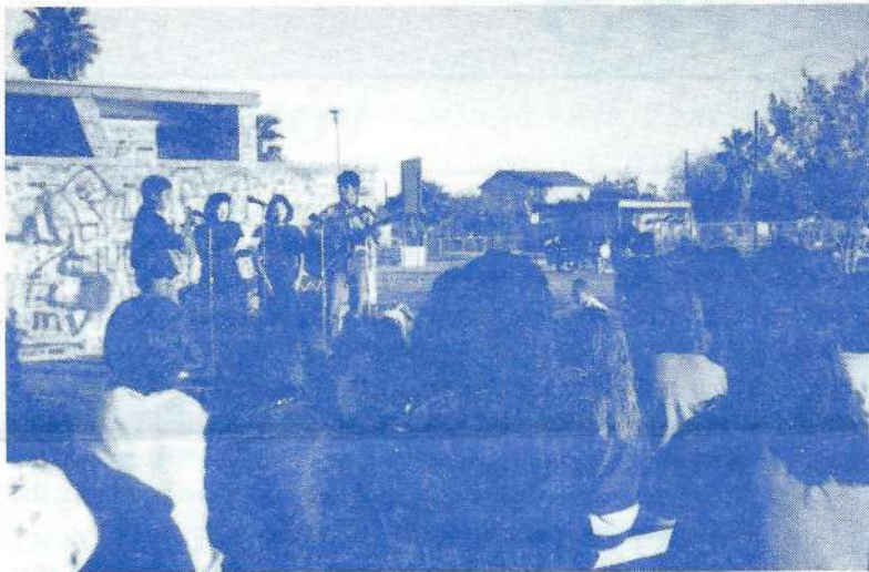
Open-air-evangelism – A quartet from the Rio Grande Bible Institute shares a Latin presentation of the gospel to the crowd gathered in the town park of Pharr, Texas.