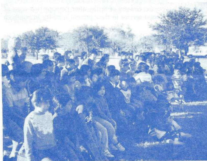
Neighborhood guests – These parents and children were part of the crowd which heard the gospel presented by a group of about 30 Latin students from RGBI. Many in the crowd came because of a personal invitation from the students who visited them. Some came from curiosity after hearing the students' music in the park, while others were attracted by a few of the students, dressed as clowns, riding slowly through the neighborhoods on the hoods of cars.