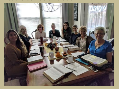
Ladies' Bible Study