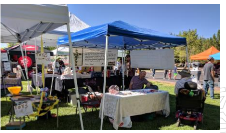
We represented "The Grace Place" at the Vins Heritage Days.