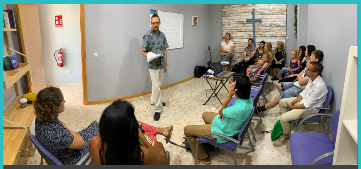
Enjoying lots of "first time visitors" to our church plant while the teams were here this July. it was a big encouragement to all of the locals.

https://www.trinityonline.org/spain-mission-trip-2019/a-long-day/