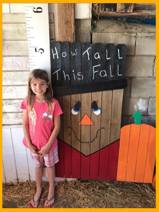
One thing I enjoy about America: all the animals here One thing I look forward to in Kenya: getting a cat