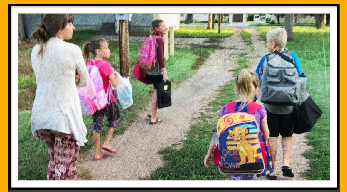
First day of school

changes with him as he grows). But for now, we are all grateful for healthy eyes that are working well.