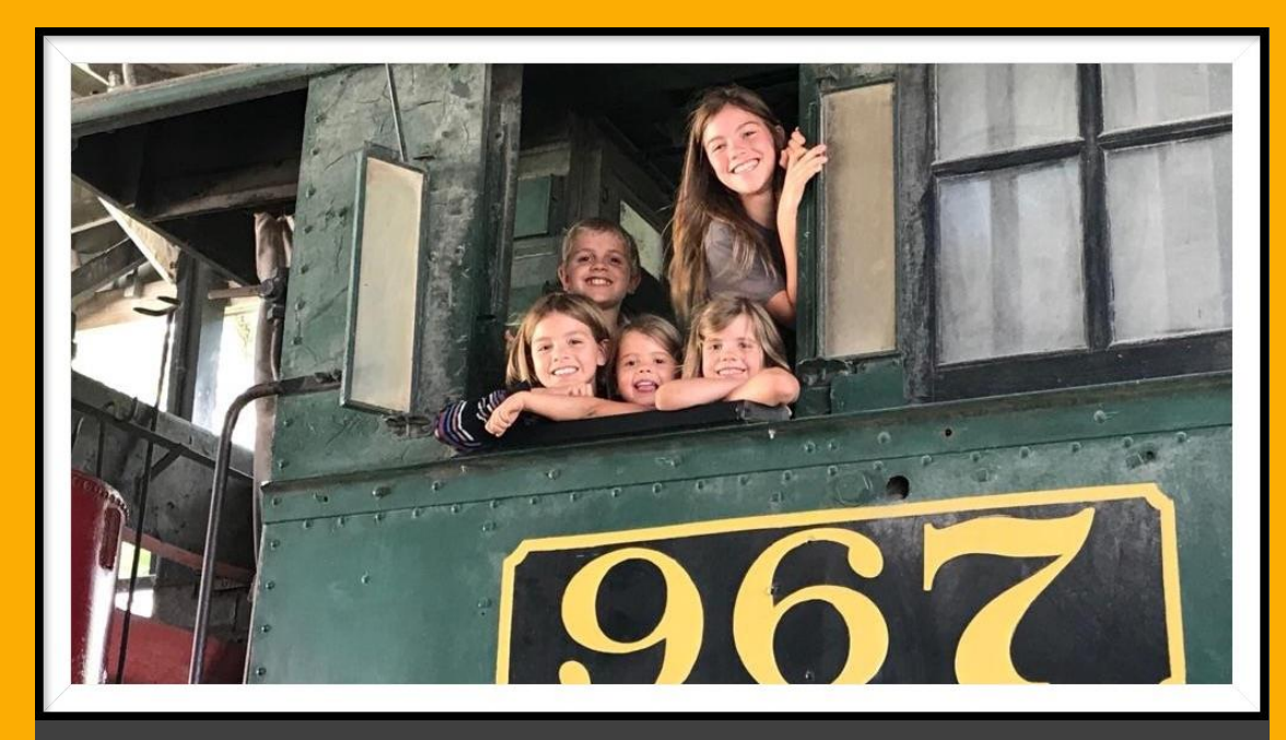
Family fun at a place I grew up going to called "Pioneer Village"