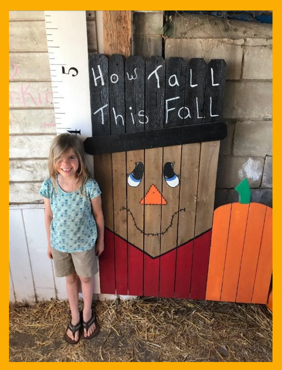
One thing I have enjoyed about America: