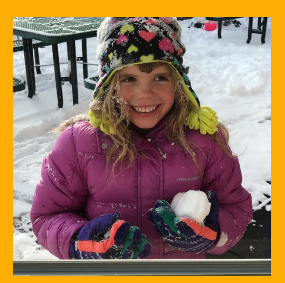
Have enjoyed the gift of getting to play in the snow!