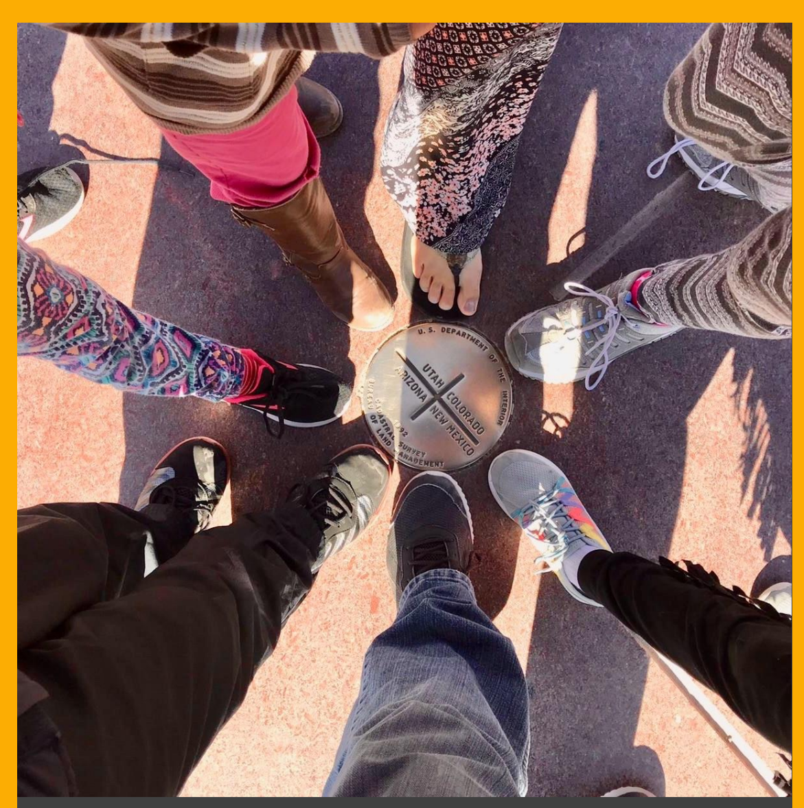
Whether being back and forth between 2 countries or standing on the 4 corners: as a family...we are in it together!