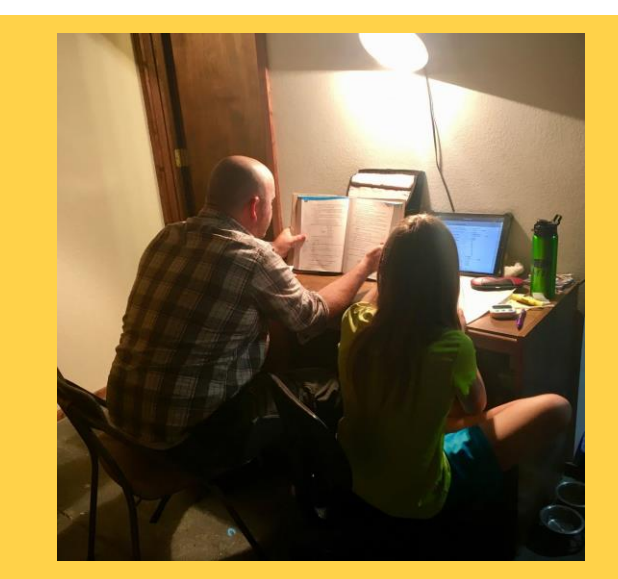
Helping with homework