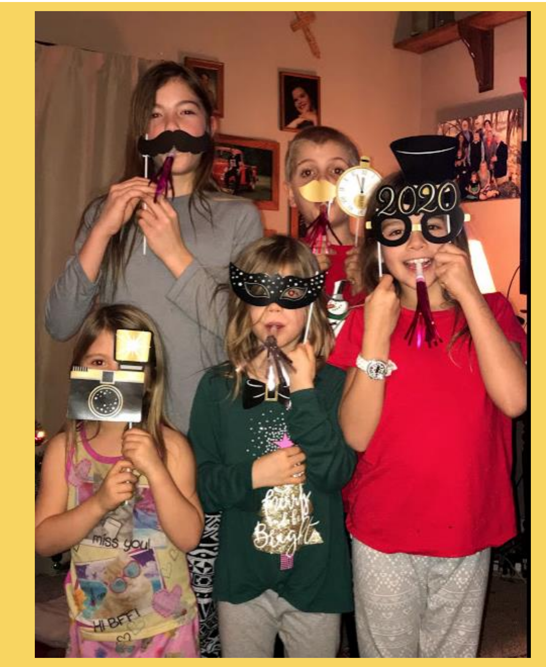
Looking back and thanking God-looking forward and trusting God