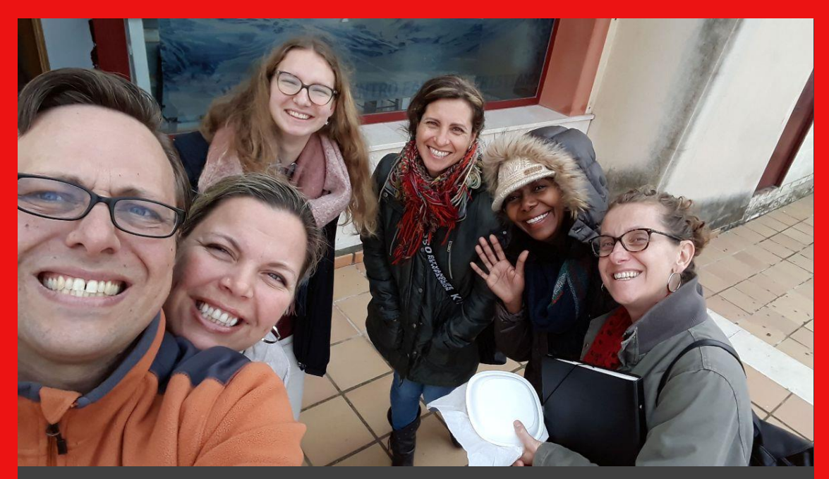
Sending lots of LOVE from our Barrio.