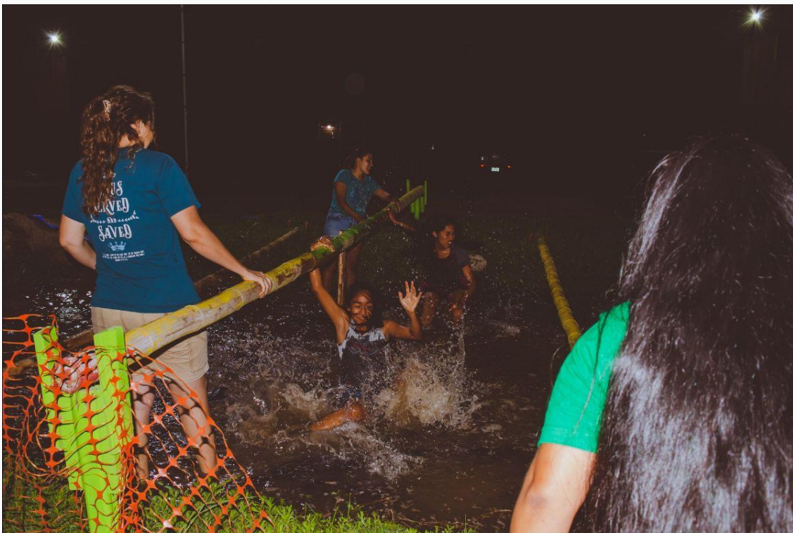
I worked on the maintenance crew for BCM ministries at a camp, while the others in our youth group worked at counselors. This was the super highlight of all my time in Lima! I LOVE camp ministry!!!