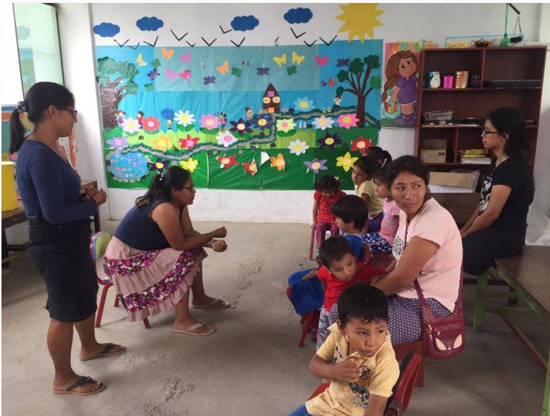
This was a VBS we carried (in taxis!! I still can't believe we did that) to a small town called Ica. We held two 3-day VBSs in one week! whoa!!