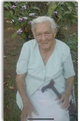
Rest in Peace, Mom!

infected. That is the reason she had to shave off her beautiful hair a couple of months ago, and here she is once more. When she gets quite discouraged, I jokingly say that God has a great sense of humor in giving her a very "interesting" blood type and that she should take courage in that - her blood type being "B +". At times we both laugh, but honestly speaking, at times laughing becomes a very challenging exercise. This is such a time. Around these days is when she simply turns off her phone for days at a time. Of course, we ache for her as well. My health