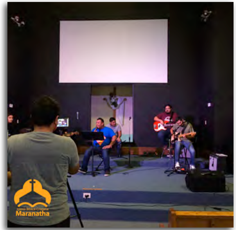
Staying in touch with God's people amidst COVID-19

services but we could only do this for about 3 Sundays, as things suddenly exploded in COVID-19 positive cases all around us, though thankfully NOT within our church services but only in our members' work-related areas and relatives. As things now stand, several of our church members are currently infected with the virus and we find ourselves very busy contacting them to provide encouragement and help, even as we try to protect ourselves as much as we possibly can. Our area has suddenly become a hot spot for this nasty virus.