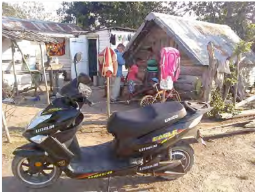
Our beloved Cuban brothers in action

As to our ministries in Ecuador and Cuba, that also had to be put on hold. For the past 11 years I have been going to Cuba up to twice a year, but not this year. In fact, our plan was to take two of our Maranatha youngsters there to explore and to develop a passion for missions, but our plans had to be canceled. I've also been going to Ecuador to hold pastors' conferences for two years in a row and they were really excited and expecting me this very month, but it