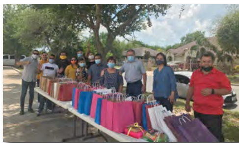
Waiting for our Back-to-School kids to driven in for prayer and their gifts

What do all the flags above represent, you may ask? In the midst of the current pandemic and struggling to meet the spiritual needs of our church family, we find ourselves with the challenge to resort to new and never-before used technologic methods to accomplish our goal. Some of our old equipment was quite broken, useless and in some cases non-existing. So we've made some purchases to take the Marantatha ministry on a virtual mode. I am so very happy to inform that COVID-19 has compelled us to be resourceful in order to keep ministering to our church members... and even going beyond our immediate borders.