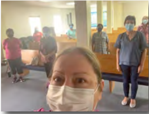
The power of praying women

A major ministry that has really been active among us is that of intercessory prayer, like day and night. We can't neglect this spiritual discipline, especially during these difficult times. Now, as to some believers wanting to go to the next level and getting baptized, well this is also a new for me, as I share the Bible study on the subject via WhatsApp. The ages vary considerably from about age 9 to about 45.