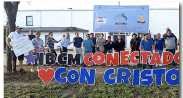
Ready for our church car drive-through

My dear wife continues to faithfully serve alongside me, even while she constantly deals with chronic aches. Because while it is true that we are in pain, we are not completely broken, for when we are weak, then are we really strong.