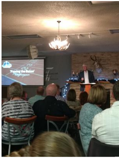
TBM 35 th Anniversary Banquet

In September, TBM had their annual board meetings and candidate school where we welcomed three new couples to the TBM family. During those three days, we were able to have some sweet fellowship with our