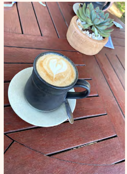
Yummy Kenyan coffee

He is my one and only provider, protector, Father and friend....and I'm so thankful He has asked me to come along with Him on this journey. Through every trial, hill and valley there is no place I would rather be, than beside my Savior.