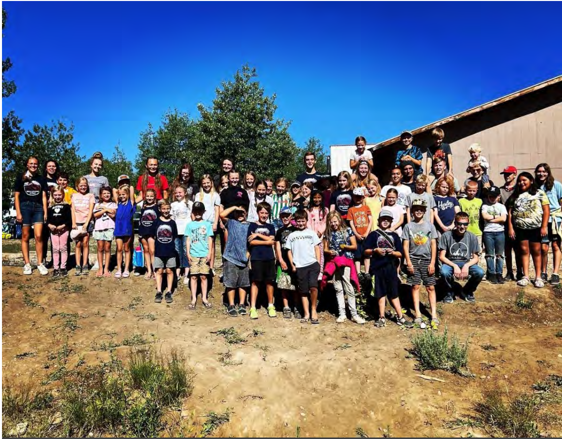
Here is a picture of those who attended Jr. Camp up at Cedar Mountain Retreat.