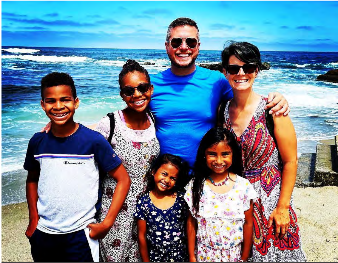
Another picture of vacation in San Diego.