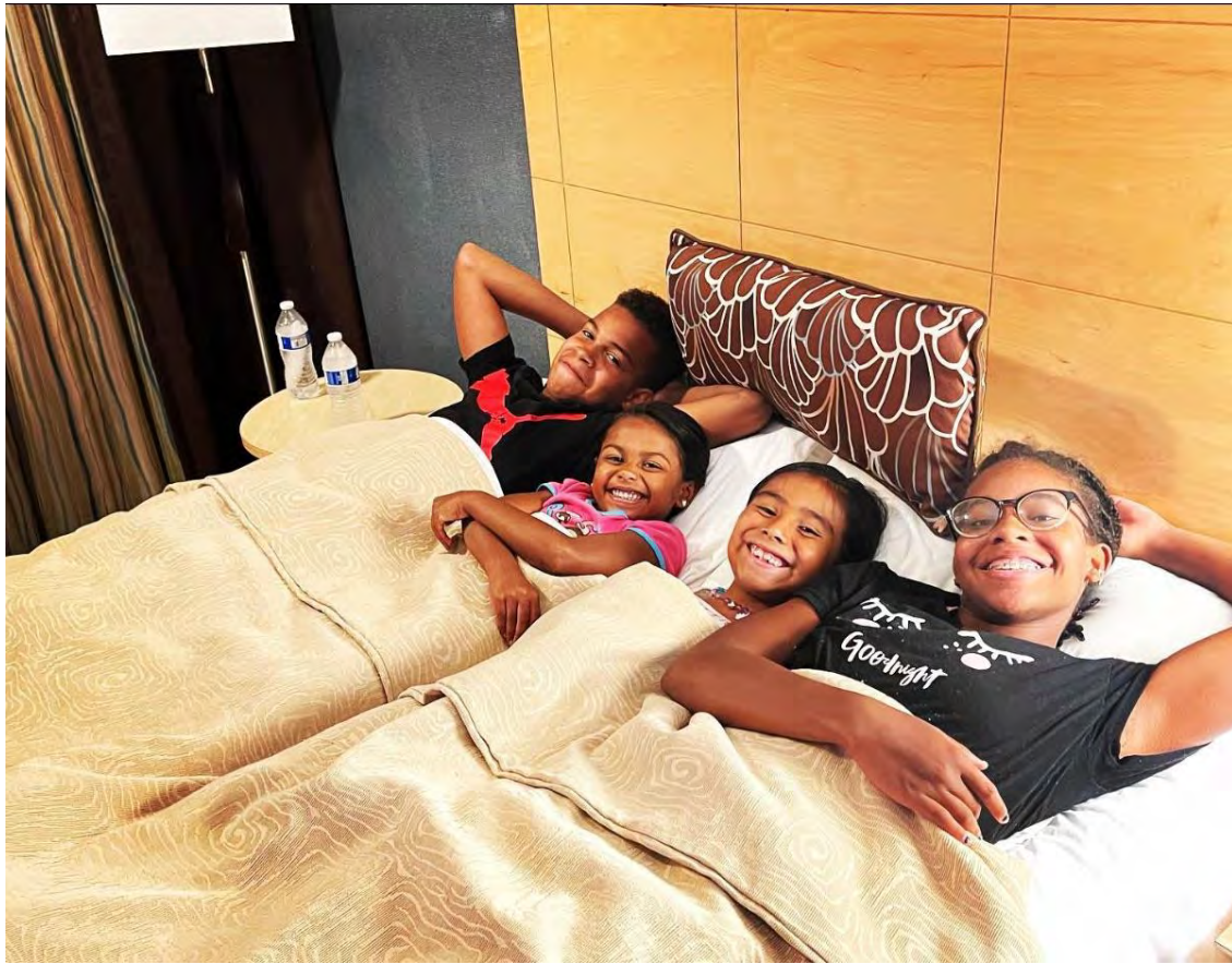
I love my family! A few weeks ago, we took a long weekend and went to San Diego.