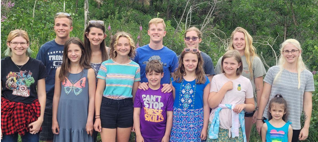
Of course, we have to show off all of our grandchildren, our granddaughter-in-law and one great granddaughter! Continued blessing.