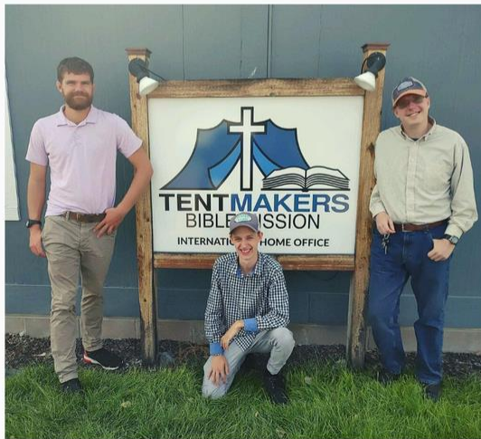
The Church Planting Team