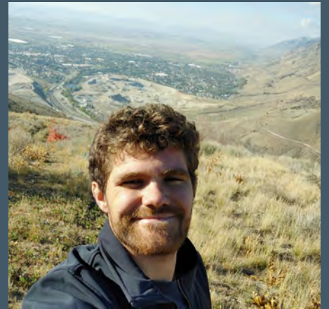
My hike up a mountain near Brigham