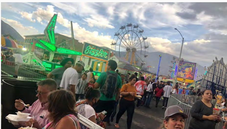
Brigham City Peach Days.