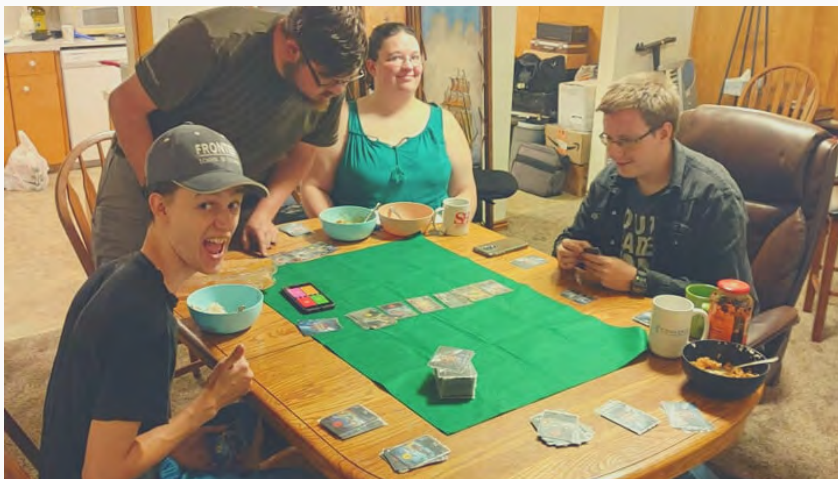
Our first guests

Go to this link * then click on the green "Support the Weber Apprenticeship Project" button.