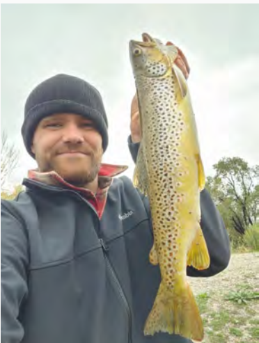
My first brown trout