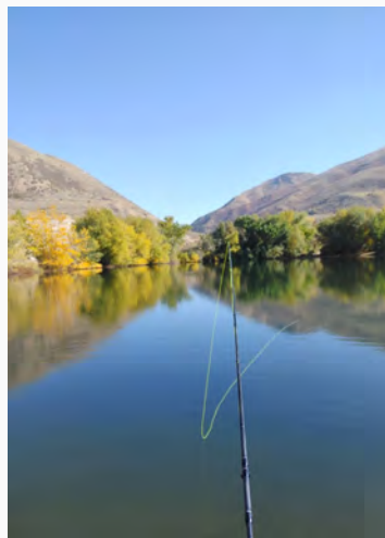
My favorite fishing pond