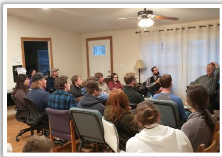
Envision Workshop on reaching Muslims

We have had a busy spring at Tentmakers Bible Mission. At the Envision workshop, we heard from two missionaries who serve Mormons and Muslims. It is exciting to hear how much opportunity there is, even in our own country. Using online language study, one of these missionaries has reached more people and seen more fruit than previously! Many students attended, and we all packed into the room to listen.