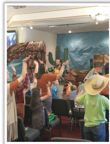
Singing songs at VBS

Our family has adopted a word for the year, and it is “serve.” We are choosing to serve in many different ways. We have so many opportunities here to serve, and we would ask you to pray with us that the Lord would either continue to raise our financial support or allow us to bring in more income without sacrificing our ministry. Thank you for your support!