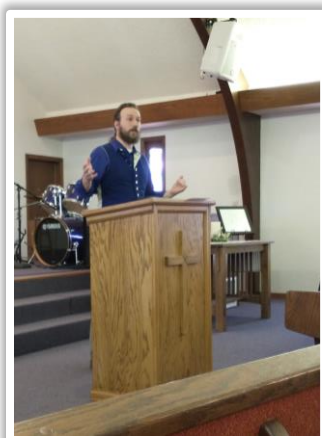
Filling pulpit at a local church