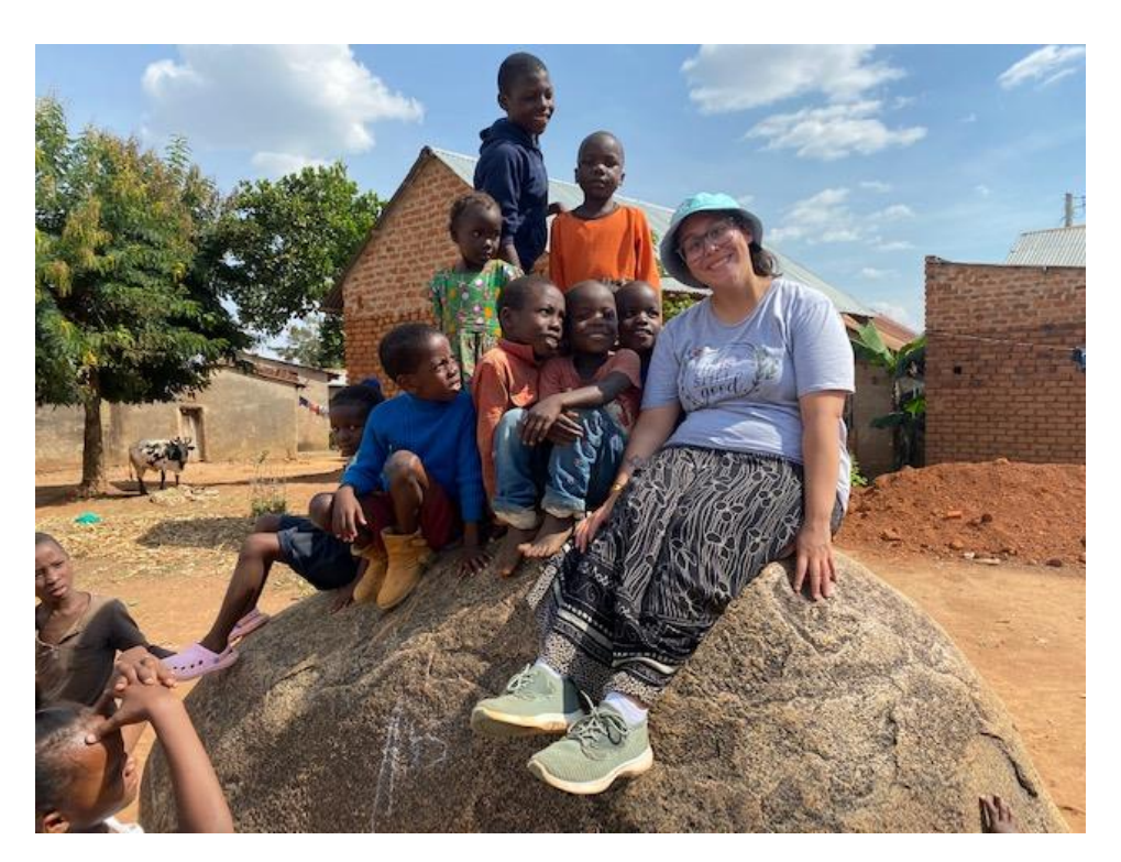
Some street kids around Tuba