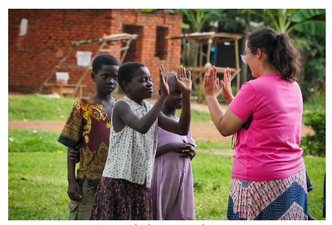
Street kids in Katachonga