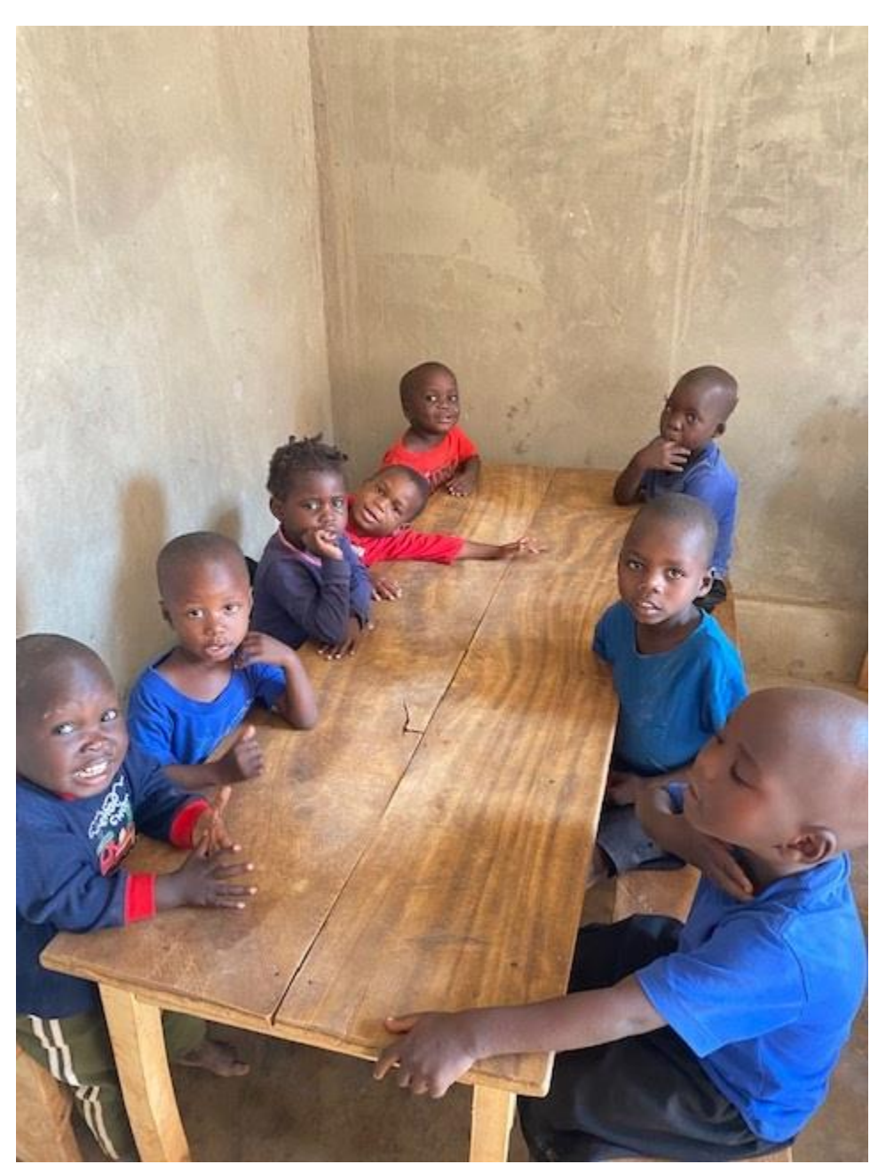
Kids from Loved