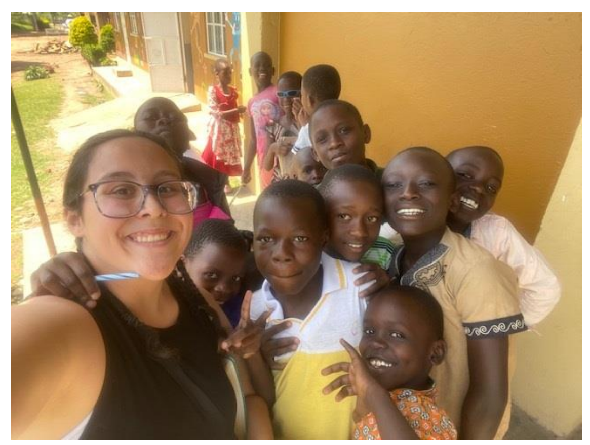
Sunday school kids