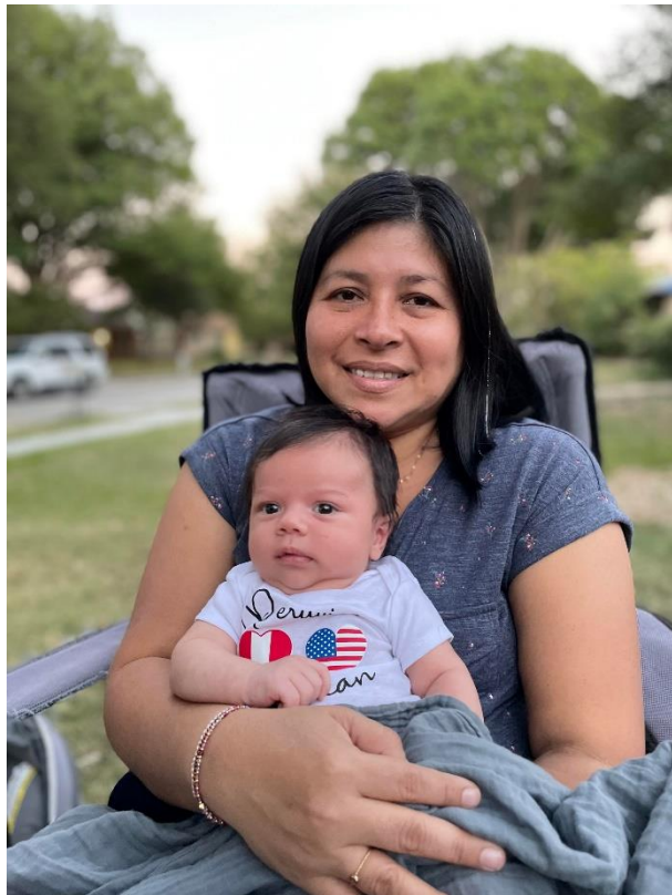
Techy holding the precious grandson!