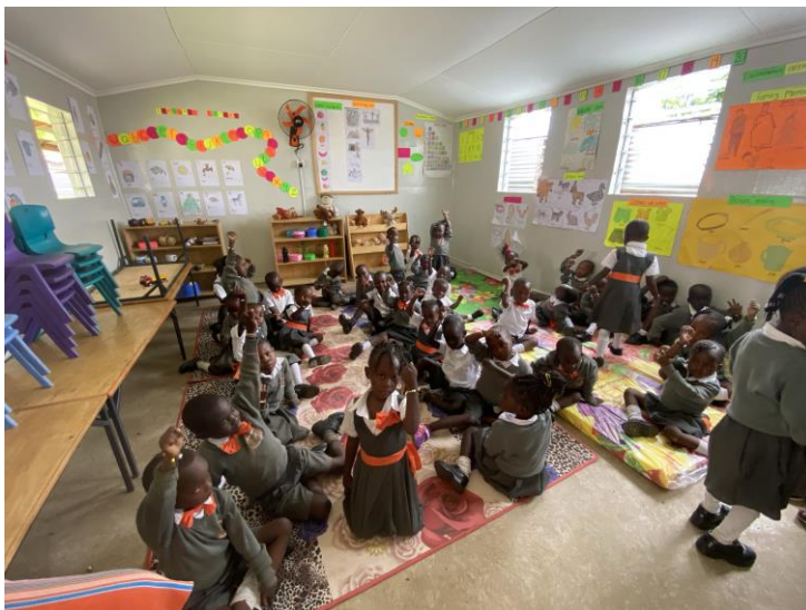
The kids made gospel bracelets at Ndoto