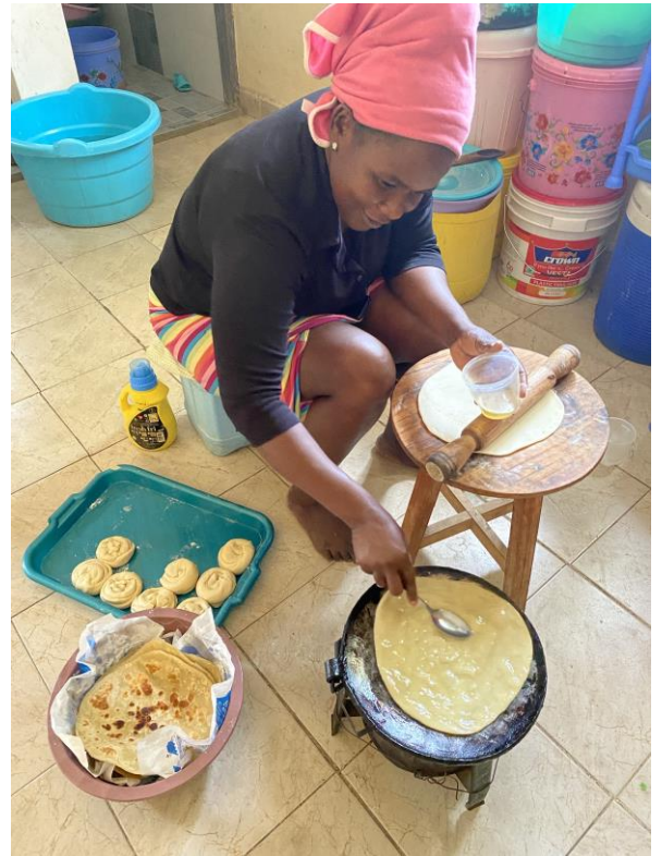
Being taught to make chapati