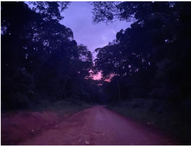
Sunrise in Kakamega Rain Forest