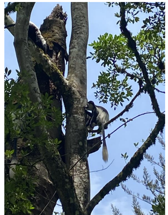
A Colubus monkey spotted in a tree at Rondo Retreat center