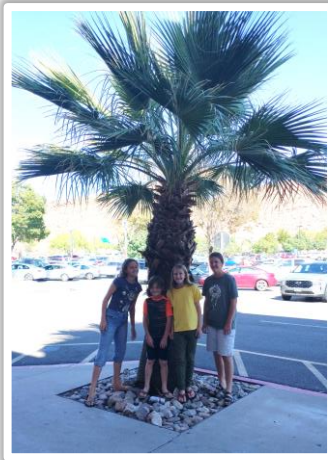
The children were so excited as they told us this was the first time they had ever seen a real, live palm tree!