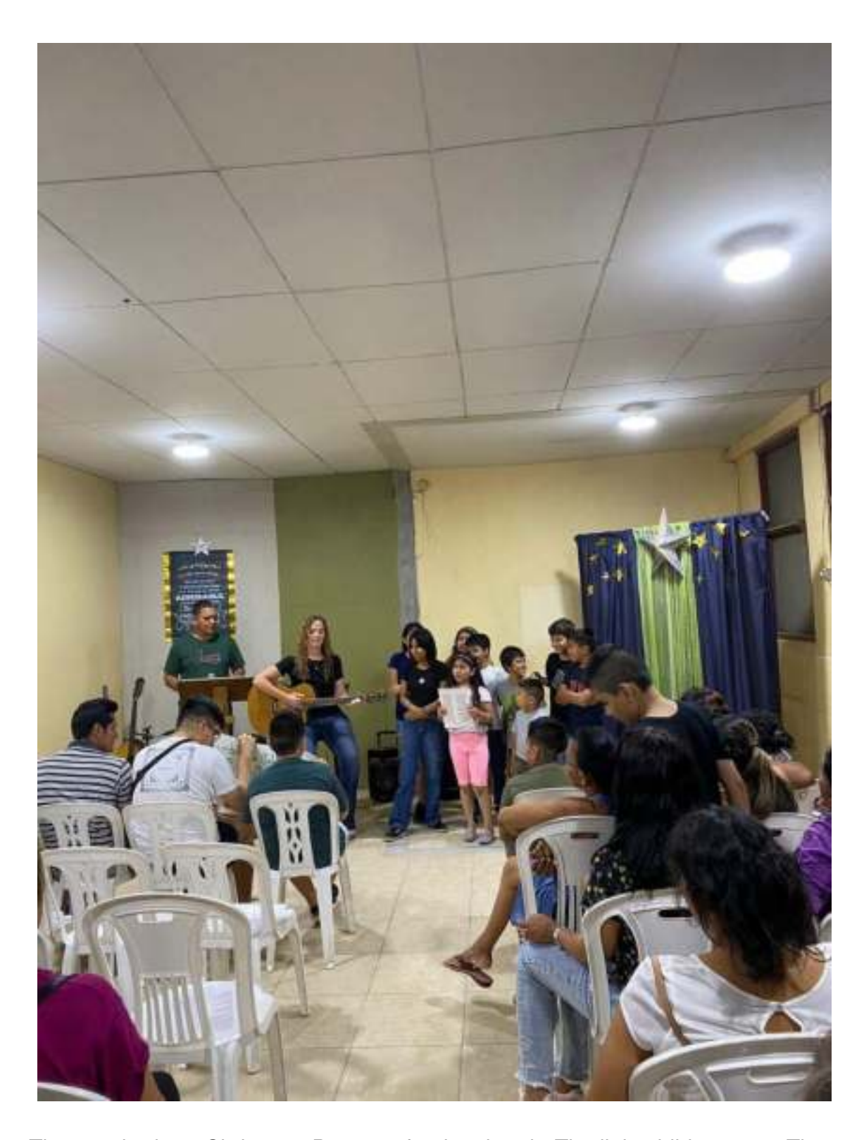
Then we had our Christmas Program for the church. The little children sang The First Noel.