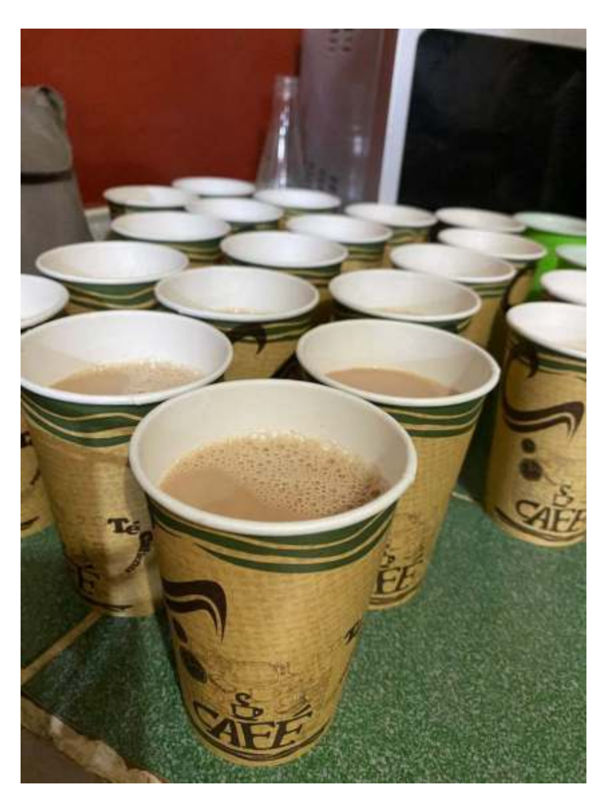
.... and lots of hot chocolate!!!!