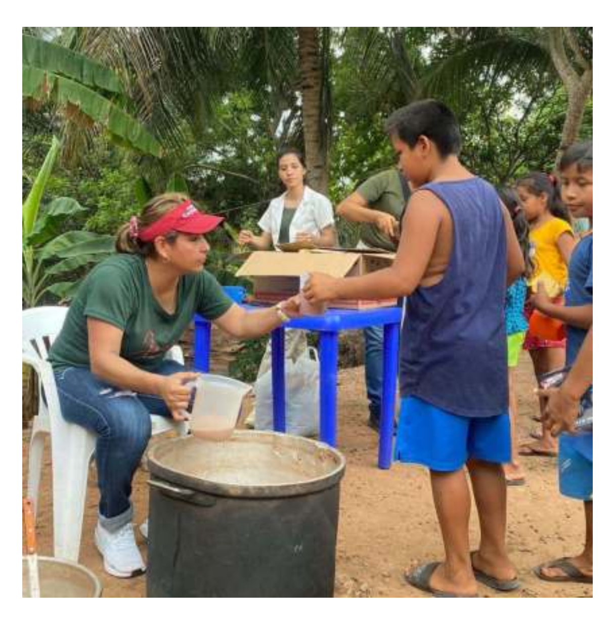
We always have hot chocolate and Panatonne to share after the closing!