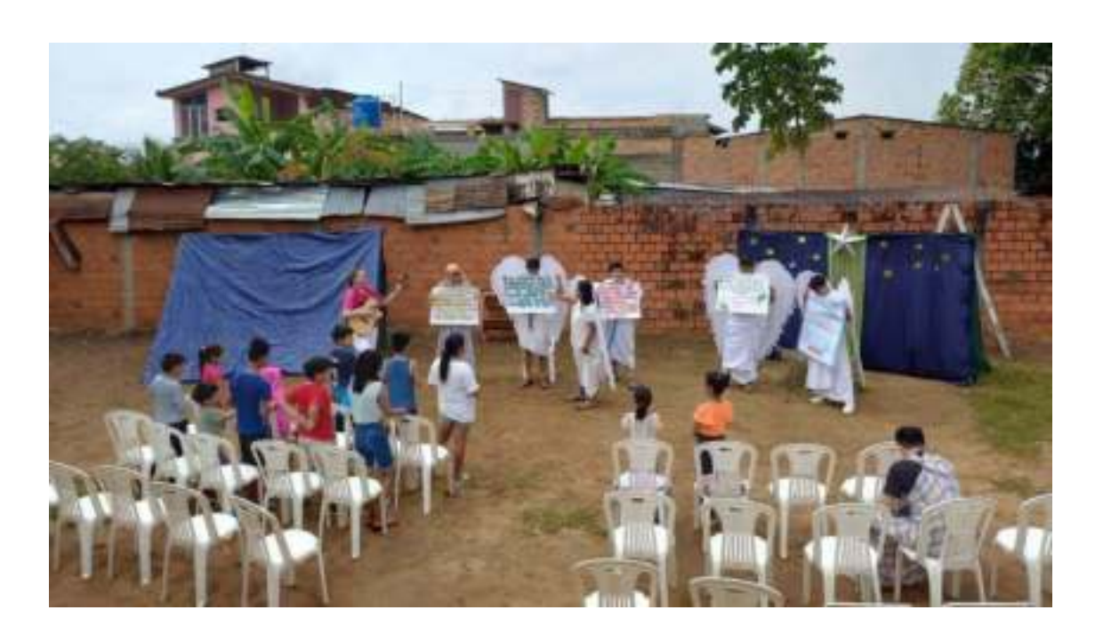
This is the Children's Christmas program that we had at our church. I worked a ton on making the angel wings. Here, we are singing Joy to the World (Al Mundo Paz)