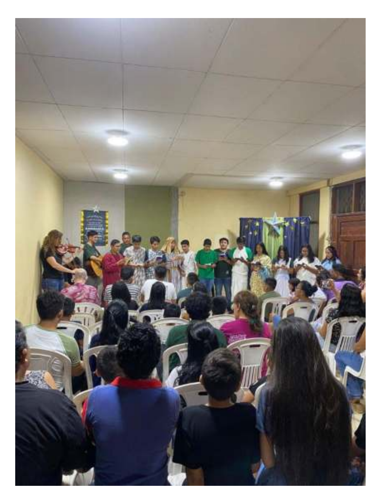
The Youth group sang Tu Dejaste Tu Trono (You Left Your Throne). It was really special to practice having this group sing in a chorus.