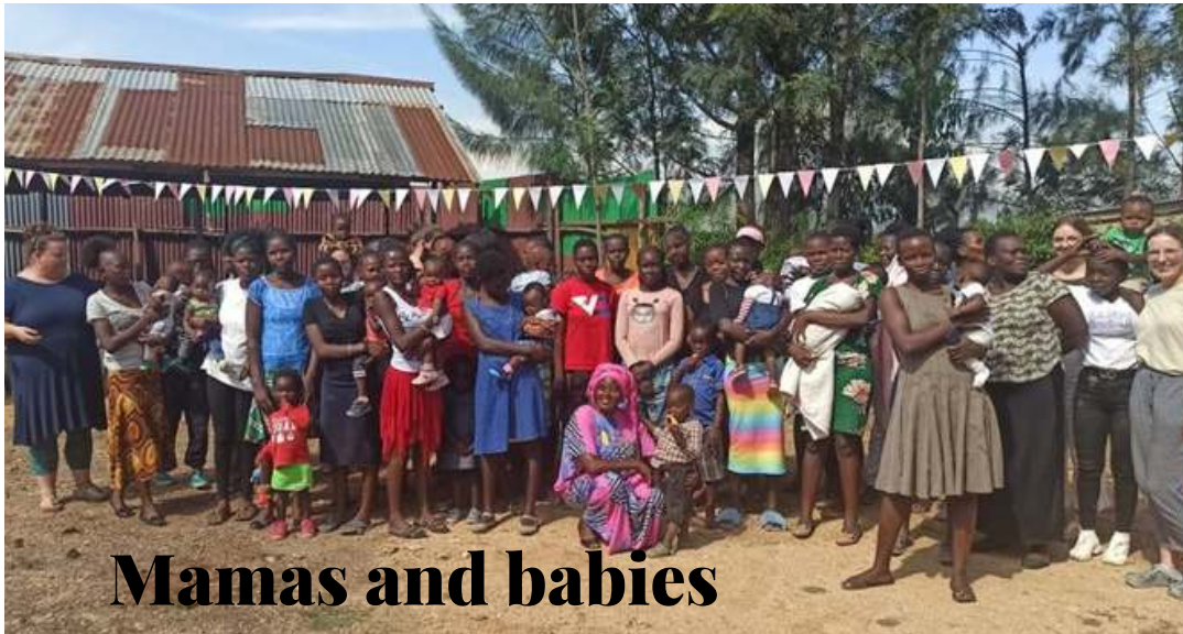
Mamas and babies