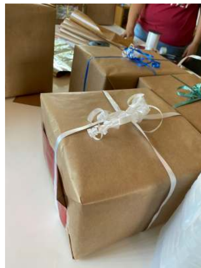
The dignity boxes consisted of...

Sanitary pads, soap, toothbrush and toothpaste, petroleum jelly for baby, diapers, rice and beans.