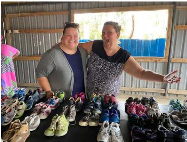
Tables of blessings...shoes and toys for baby, clothes for mama