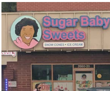
A funny store in Las Vegas

If I am honest, life has been very difficult for me spiritually. Having a good team split, a break up, quitting my job, future planning, relationship issues, and financial troubles have all been very faith stretching these past couple of months. The main thing that is hard for me is trusting in God when things do not make sense. God has been comforting me with His Word every day. I have enjoyed the wisdom from Proverbs. God has also used people praying for me to encourage me to carry on. My prayer life and love towards people has been growing, so I can't ask God for anything more.