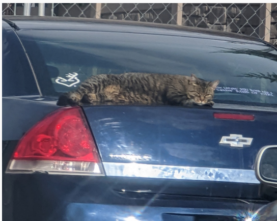
The Cat that thinks he can just do whatever he wants

I am quitting my job this week. I am wrapping things up at Rocky Mountain Bible Church and getting ready to move. I plan to move to Saratoga Springs, Utah. There I will be church planting and connecting with other churches. I am still finishing up the apprenticeship and have learned a lot about Church. The three guys are still going through a Biblical eldership book and it has been great. I have done some ice fishing when I have time. I also have been doing a lot of over the phone discipleship with campers, friends, and people mentoring me. God has been really stretching my faith as I strive for His plan.