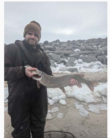
Pike fishing in Michigan with my dad and uncle