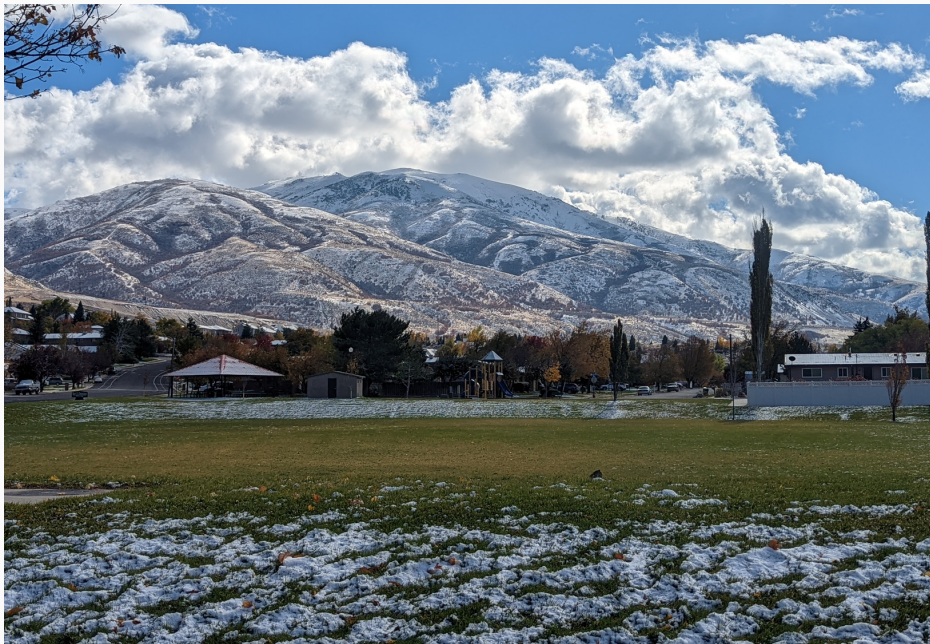
My favorite park to do prayer walks

I am planning on visiting family for a little over a week. I also am planning on selling my extra car and other stuff getting ready to move. I am probably coming to Wyoming/Nebraska to meet some of you guys in April. I will visit some churches too.