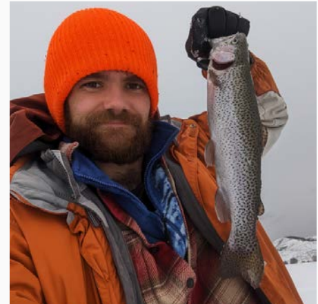
Trout fishing in the near lakes