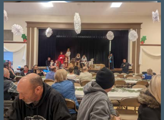
Mormon Christmas program my community was invited to