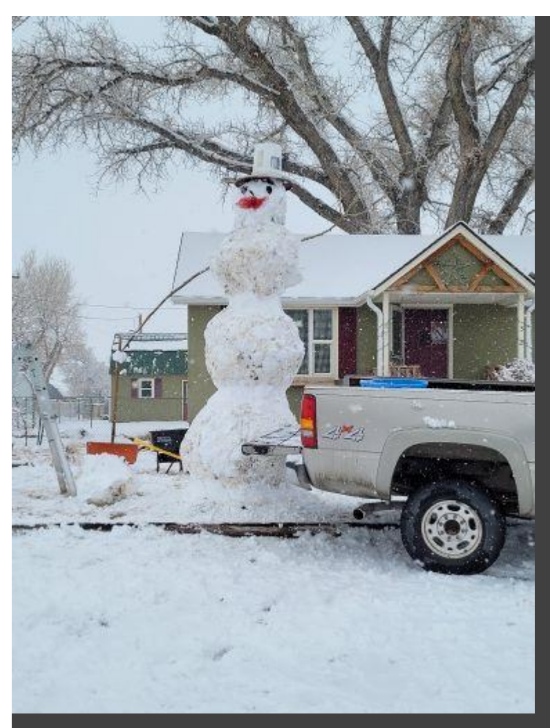
Ginormous snowman in La Grange