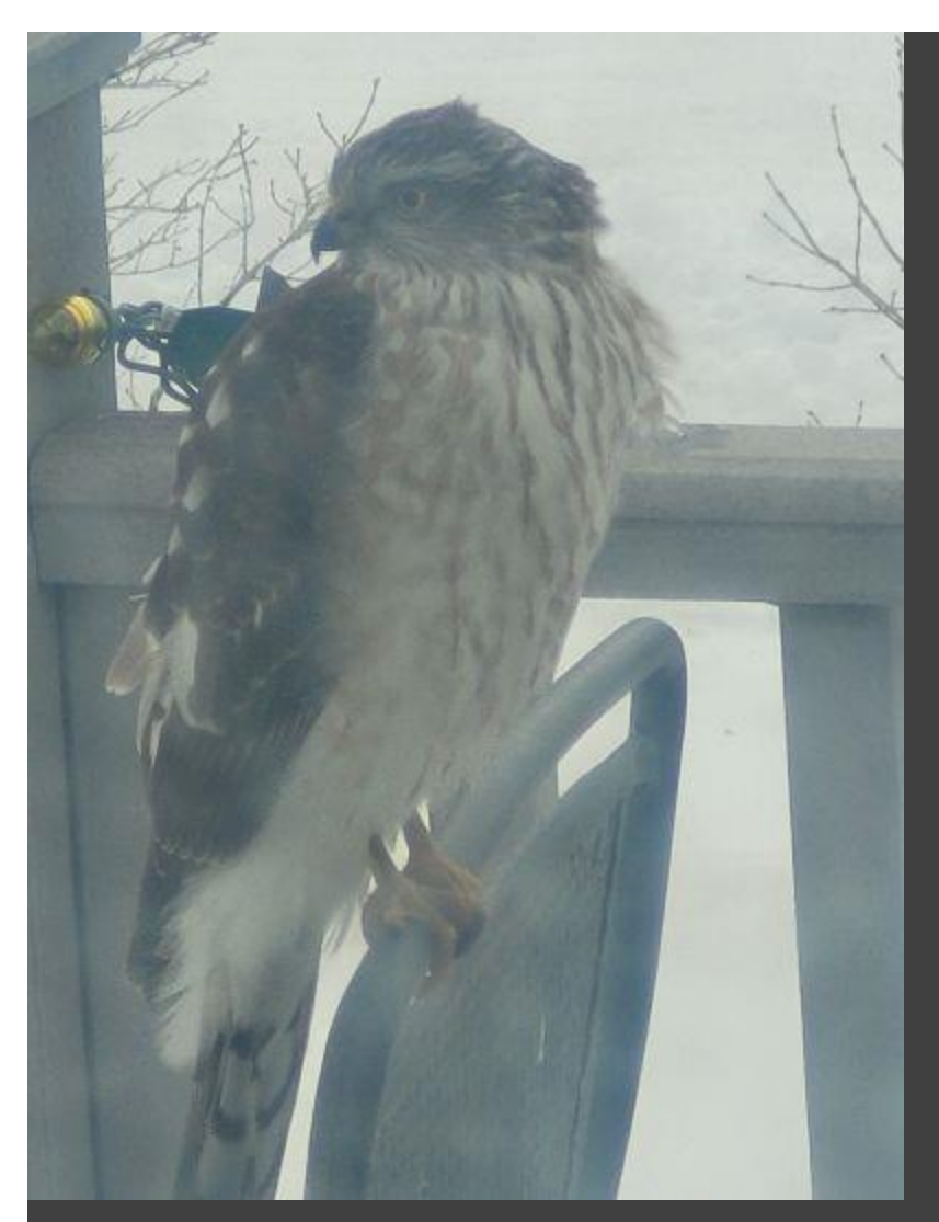
This bird of prey visited our porch three times. Way cool!