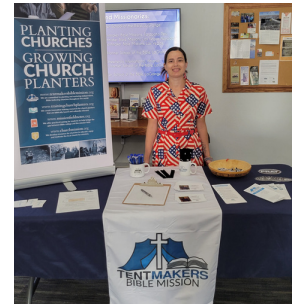
My display table at Southland Bible