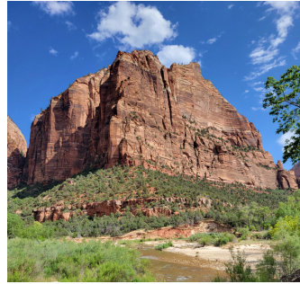
Beautiful view at Zion National Park

And, one of my favorite parts of the trip was going to Zion National Park. Such a blessing to be able to see the beauty and majesty of God's creation.