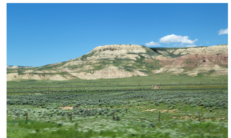
Southern Idaho, on our way to Pocatello