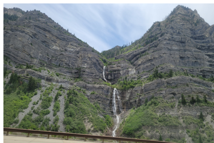
Northern Utah, in Weber Canyon

My trip to Utah and Idaho was an absolute blast! I was able to meet to of our missionary families and be an encouragement to them. Here are some photos of the scenery.