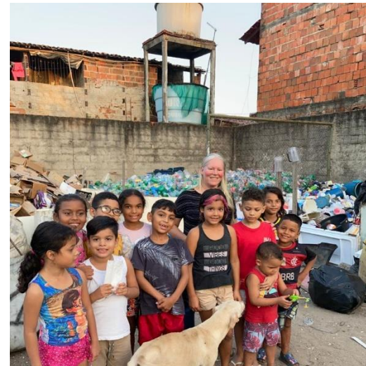
Children who trusted in Christ as savior

We applied spiritual principles and spoke of God as the great recycler. How God creates beauty out of recycled trash. God searches through the landfills of our lives filled with trash, and He rescues every broken piece, and fashions them again into a brand-new instrument once silenced by sin. When others see no value, He lovingly replaces the parts we've thrown away. Recycling and creating beauty are God's specialty. He values what others call castaways.