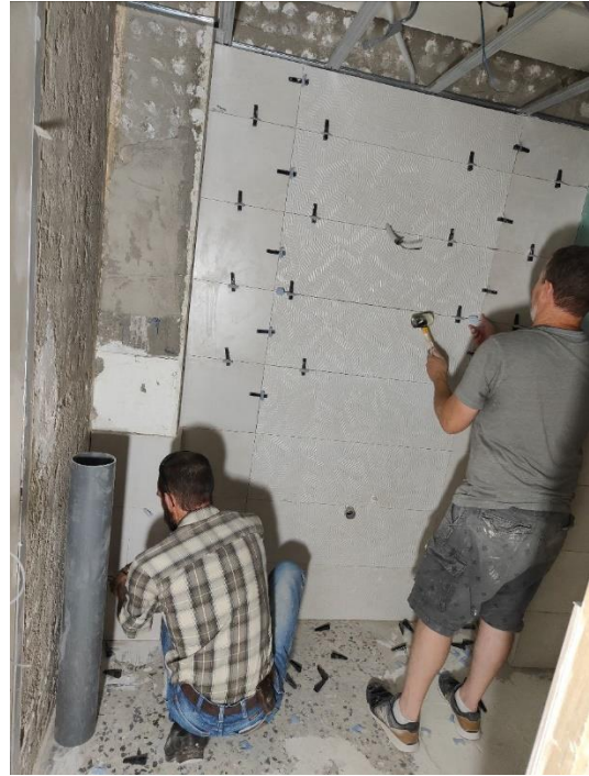
Good hard work!