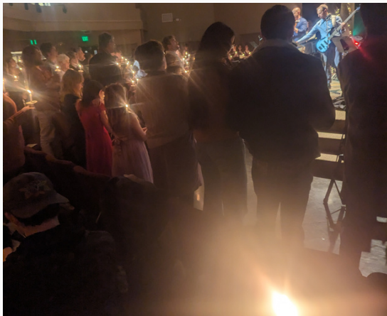
Candle Light Service at Fellowship Bible Church