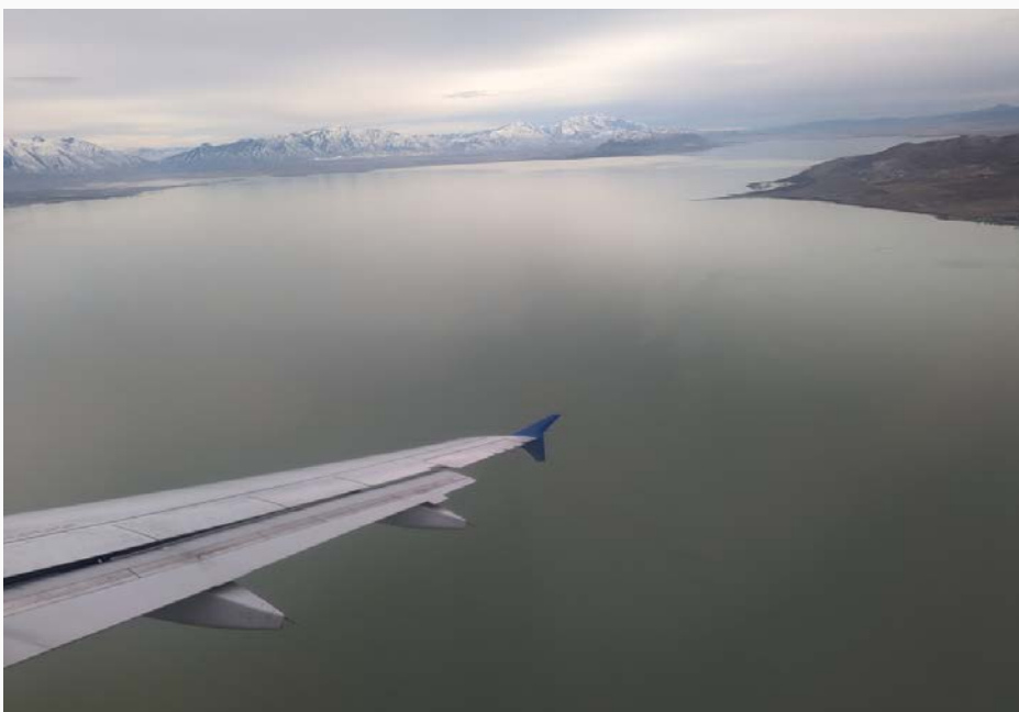
A picture of Utah lake. The lake that borders Saratoga Springs