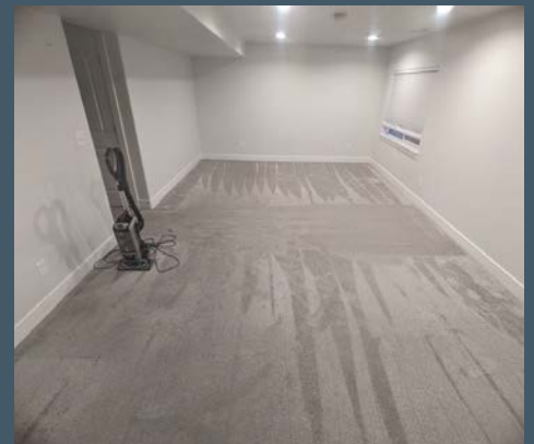
My new room without furniture. The next picture will have furniture.