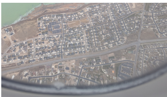
A picture of Saratoga Springs from the Airplane.