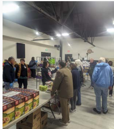
Serving the needs of my community at the food pantry