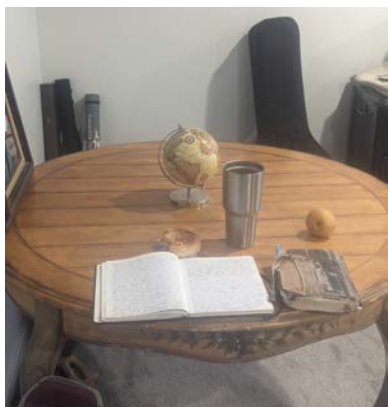
My new table. A wonderful table to read and eat at.