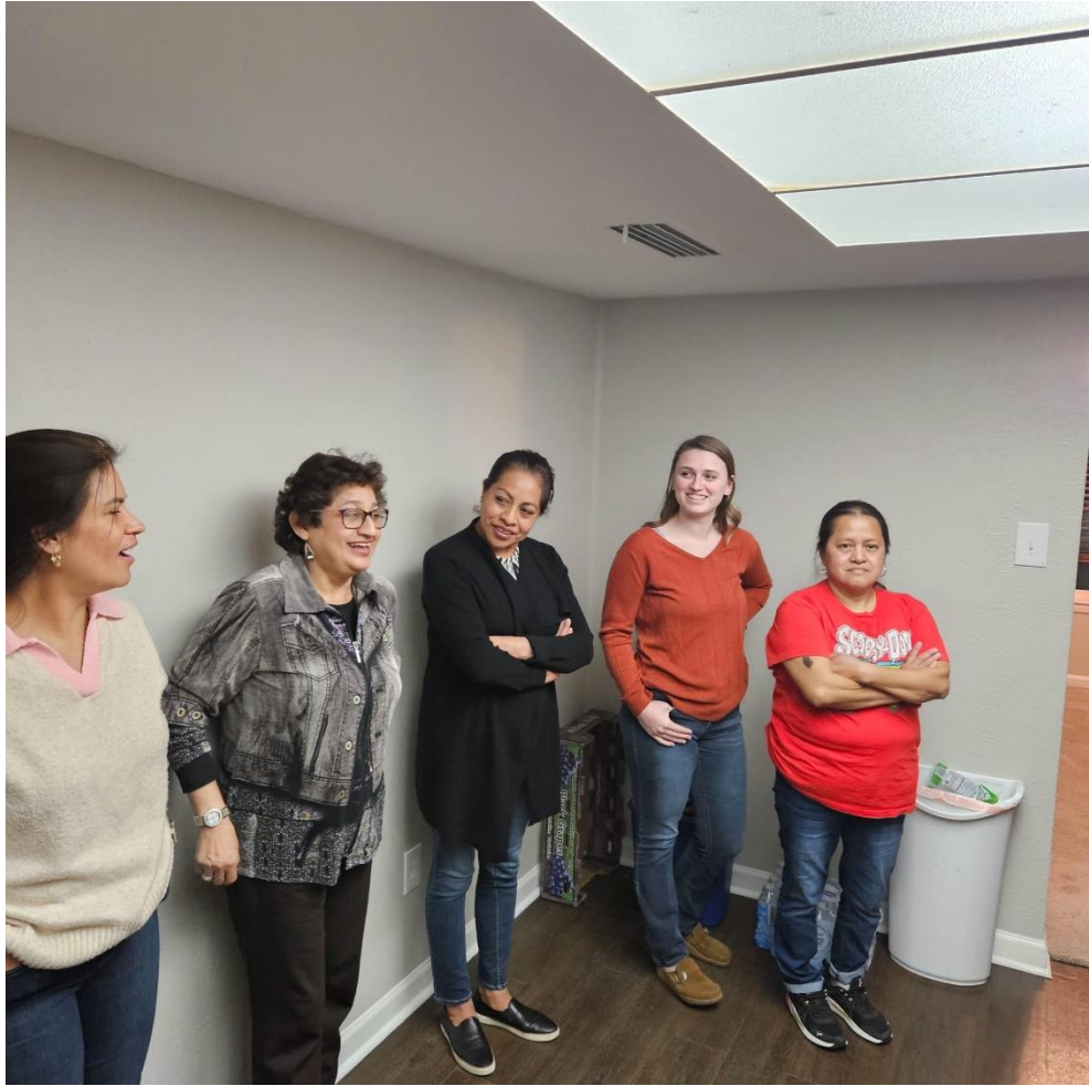
Fellowship with the ladies of the Spanish ministry!