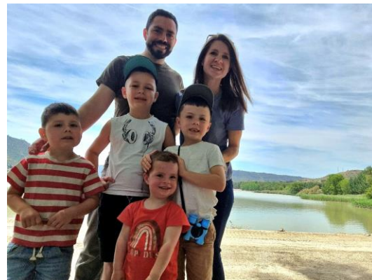
Just us :)