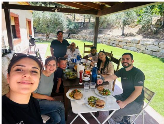
We host meals at our place to get to know people.