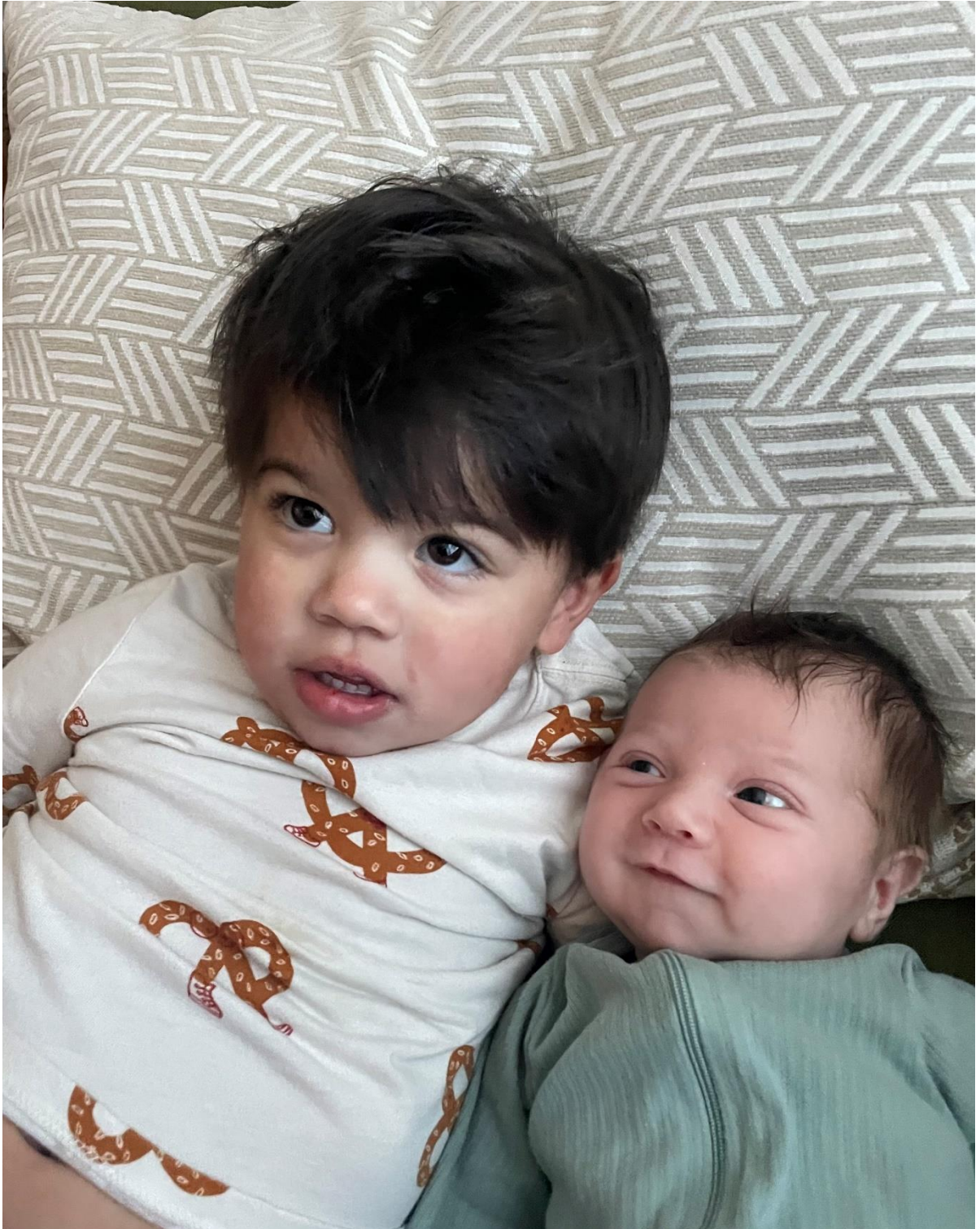
Already best buddies