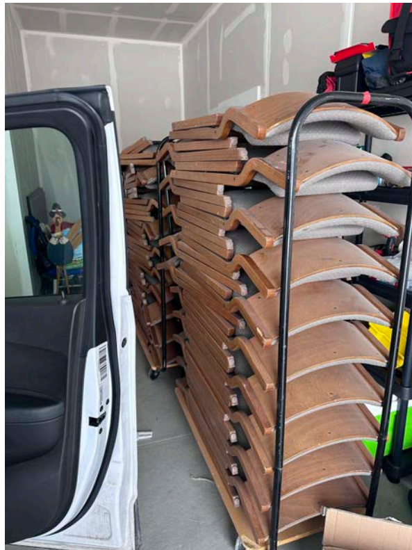
The donated chairs fresh out of storage.