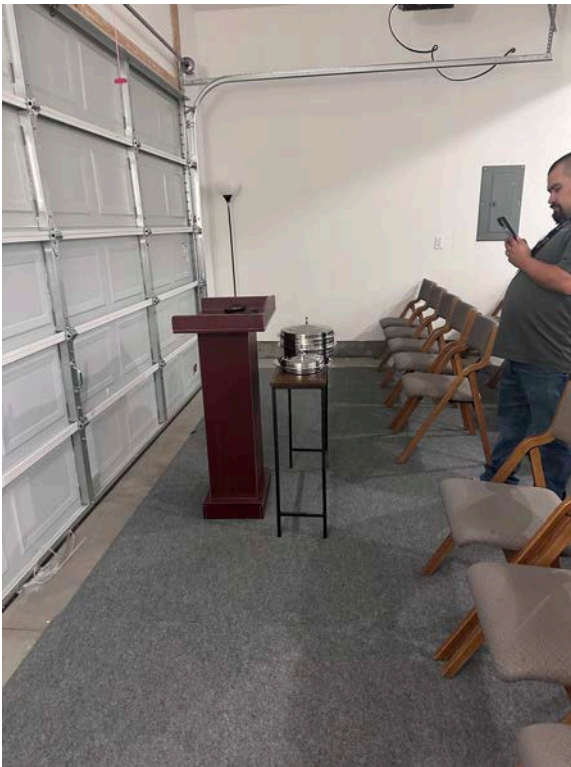
Figuring out the logistics of spacing...