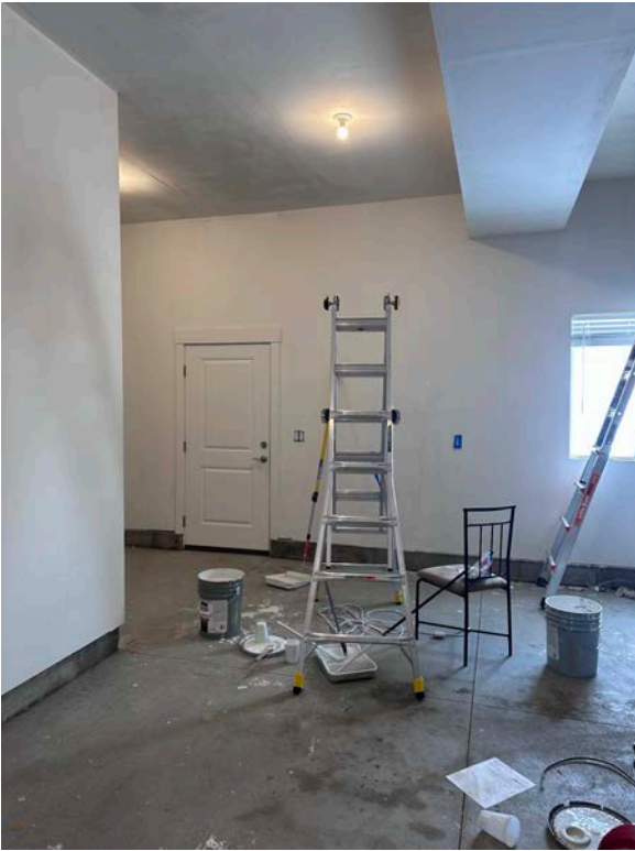
In the process of painting....