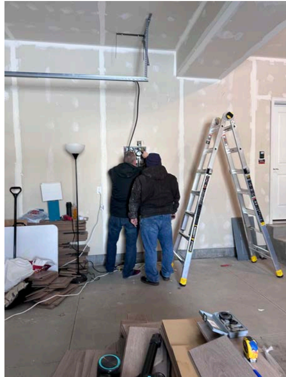
Our maintenance friend helped hook Up an industrial heater to keep the garage warm