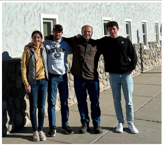
Las Vegas Team