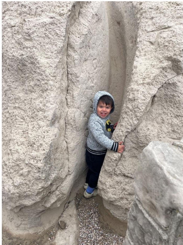
Exploring in Scottsbluff