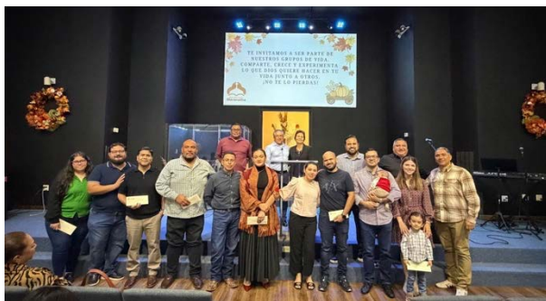
Our beloved team of facilitators