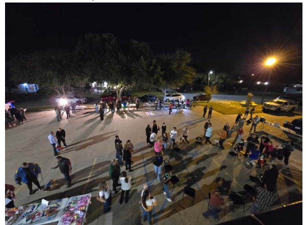
Our Fall Festival Event

This month of November, we recognized and honored all our facilitators, those who lead home Bible studies in 10 different locations. We are averaging about 100 people in these small groups every