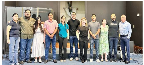
We rejoiced with those who were baptized.

Maranatha Matters ~ We've had a great few ministry months at Maranatha. After our Cuba missions trip in July, we had 7 believers get baptized, amidst great joy and celebration by the entire congregation. Last month we expressed our appreciation to our Sunday School teachers and all other educators who spend quality time preparing and teaching our young children and youngsters and adults alike. Please pray for them all, as they are those who not only teach today, but also those who prepare the next generation of spiritual leaders. Included among such precious teachable lives are 8 children with Autism. We are all learning how to best help them. On Friday Oct. 31, we celebrated our Fall Festival Event, where we invite our neighbors to attend so we may share with them that Jesus is the Light of the World. This year's theme was Jesus Is... What a great opportunity for us to share Jesus with all attendees. We had over 140 people attend this year, with two of them deciding for Christ.