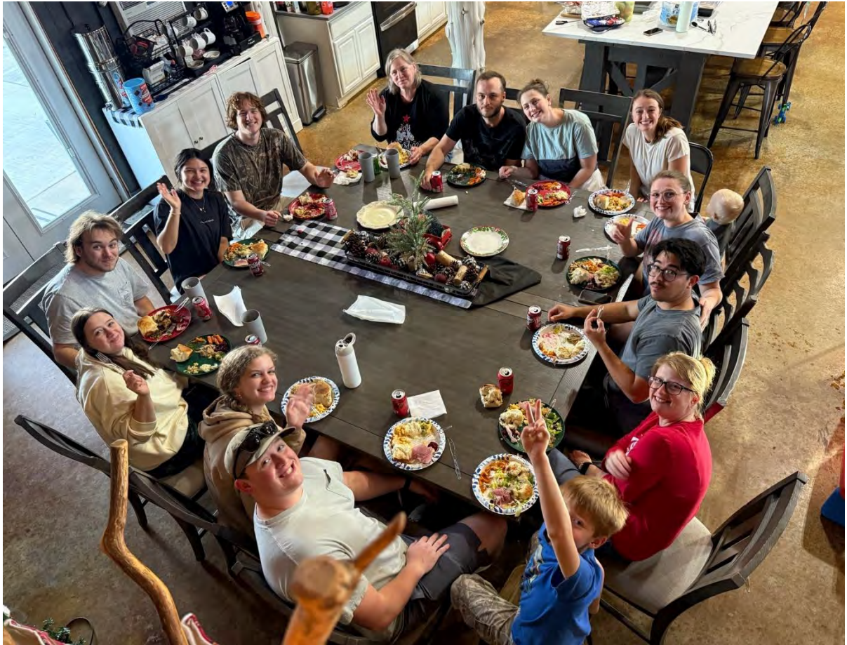
The Higgins family spent Christmas together. We stayed at an Airbnb together for four days. It was so much fun spending time together.