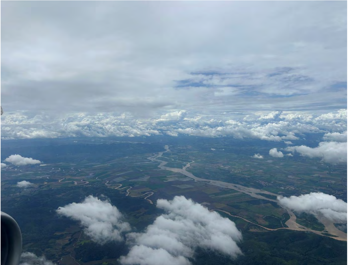
Aerial view of the Huallaga River